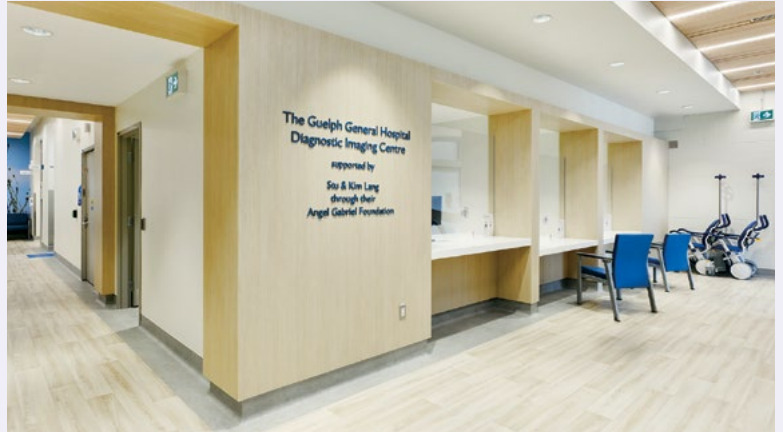
Bright and welcoming, GGH's new Speedvale Campus is now open!

"Out of constraint, we had a bold vision for a