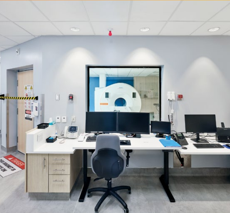
The GGH Speedvale Campus brings a second MRI machine to the Guelph-Wellington region