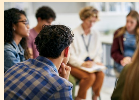
GGH staff connect through Schwartz Rounds®

In a profession that asks so much of its people, that connection matters. Because of the Bill and