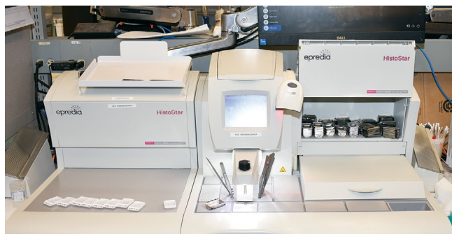
A state-of-the-art embedding machine arrives at GGH lab.

for the leadership of individuals and community groups who organize fundraising initiatives in support of our Hospital.