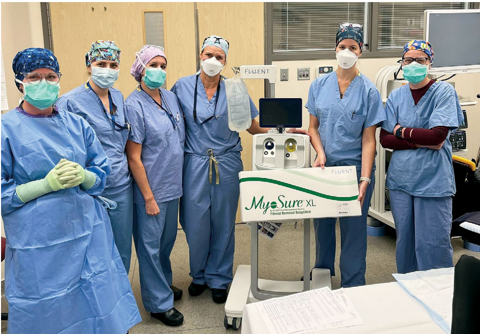
OR teams excitedly awaited the arrival of this new system.

T hanks to donors, Guelph General Hospital was able to purchase an Aquilex fluid management system and several new hysteroscopes—specialized equipment that allows gynecologists to find and remove problems like fibroids, polyps, or abnormal tissue from inside the uterus without major surgery. This equipment helps improve access to care for