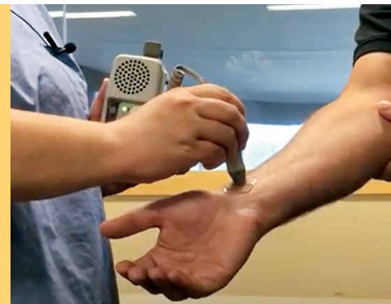
A Doppler ultrasound probe in action.